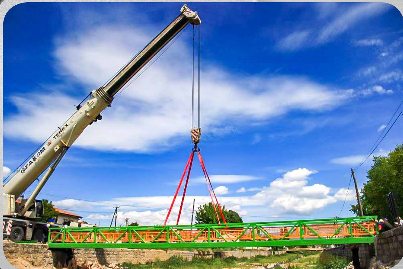
Small steel bridge from one part assembly at Municipality Prilep, Macedonia