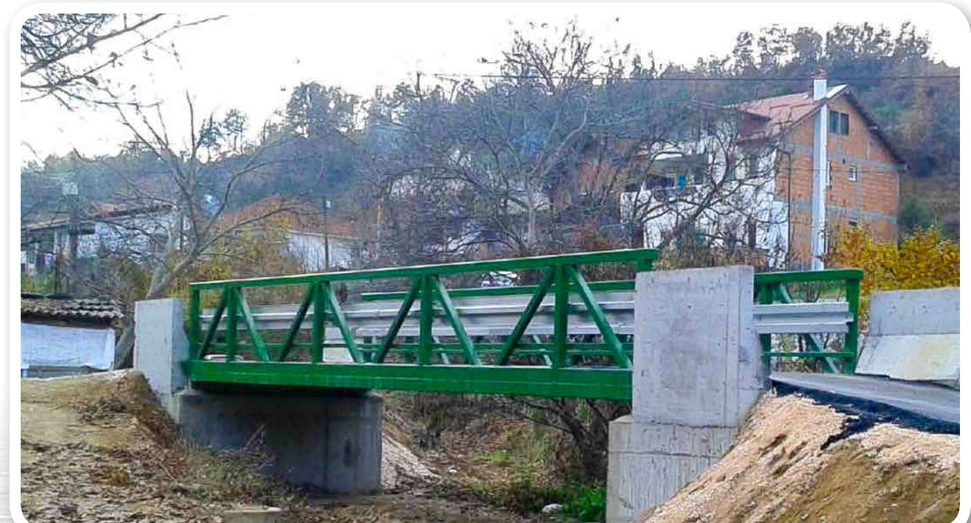
Small steel bridge assembly at municipality Skopje, Macedonia