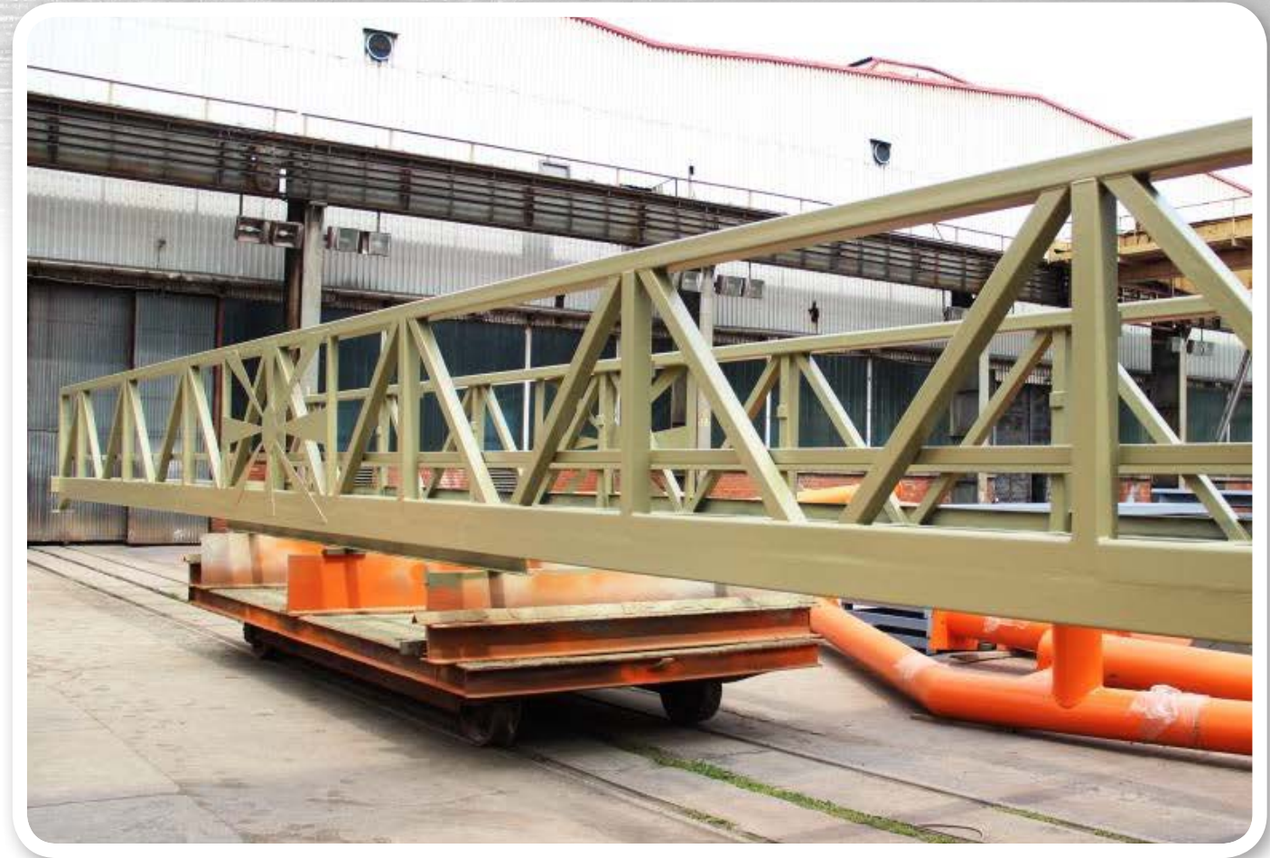
Small steel bridge Ready for transport